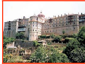
Zographos Bulgarian Orthodox Monastery